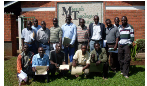
(Students from the last seminar on radio production & broadcasting)

PROJECT 1: $10,000 to equip a newly-constructed recording studio (built by GNPI, Joplin) in Mbale, Uganda. When equipped, it will help train broadcasters from Uganda, Kenya, Sudan, and other African countries, enabling them to produce Christian radio broadcasts in their language. It will also aid training in LivingStone International University which soon will be under construction.